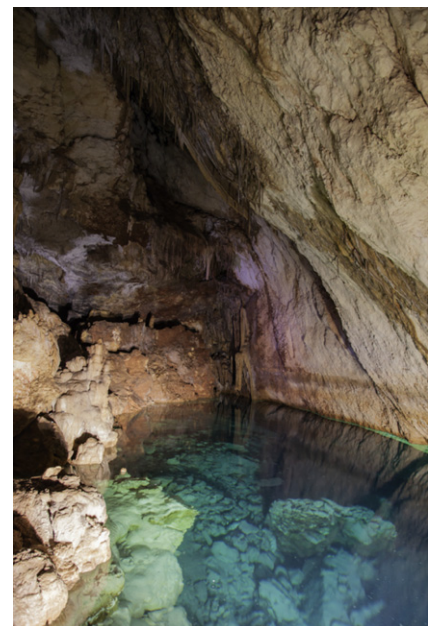
Figure 1. Spelunking for stygobionts. Brackish waters in Cova de Cala Varques, located on the eastern coast of Mallorca. This body of brackish waters, separated from the underlying sea-water by a major halocline, is a typical habitat for the amphipod Metacrangonyx longipes.

The distribution of any biological entity — be it a species, a group of species, or a population — can be