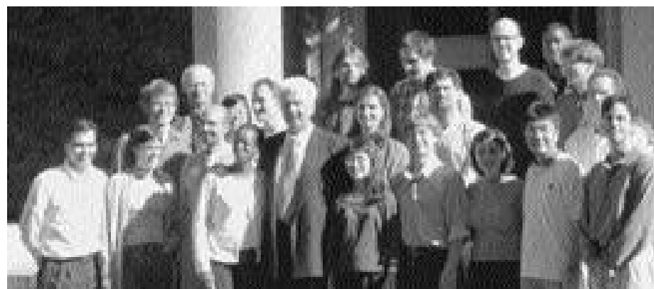
Members of the Blobel lab gathered on the steps of Founder's Hall after the media frenzy abated on Monday, Oct. 11.

Many were roused from sleep between 5:30 and 6 a.m. by members of the media desperate to get in touch with Blobel. Some press outlets apparently got hold of a list of those in the lab and