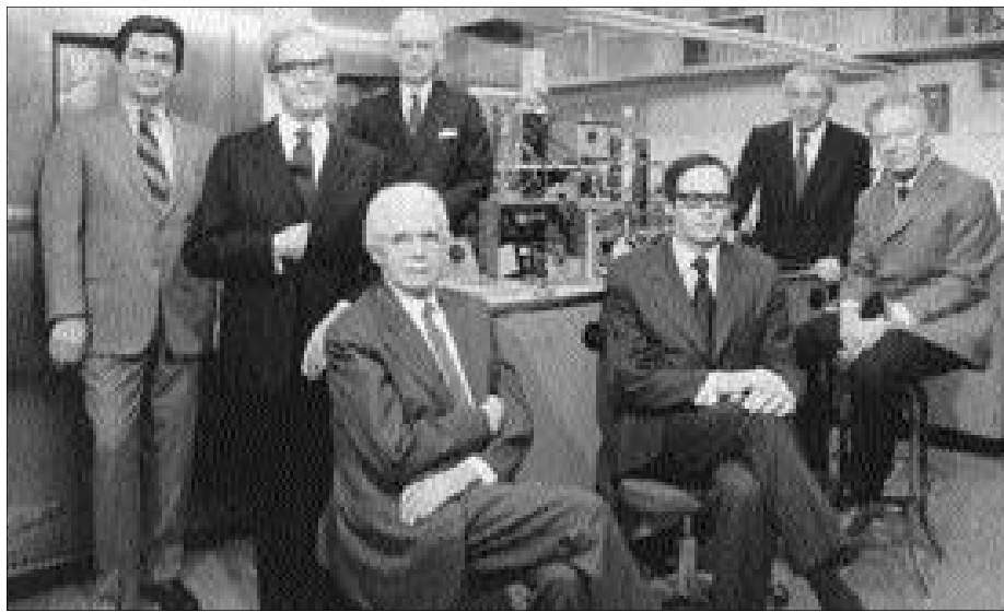
Nobel laureates gather for a photo opportunity in 1975: From left, standing: George Palade, Albert Claude, Standard Moore, Christian de Duve. From left, seated: H. Keffer Hartline, Gerald Edelman and Fritz Lipmann.

With Porter, Palade set out to explore and map the territory inside eukaryotic cells – the kind of cell that contains a nucleus, and that makes up the human body, for example. They recognized early on that the electron microscope provided only a static snapshot of the cell. To learn how the structures inside carried out various processes other techniques were needed – cell fractionation, biochemical analysis, pulse-chase procedures and autoradiography. In time, research in the Cytology Laboratory revealed a surprise for biologists: all cells in the body, whether from liver, heart, or skin, for example, have the same basic internal organization. The Nobel Prize was awarded to Palade, Claude and de Duve for the connections they made