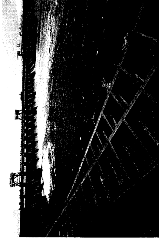
Fish ladders help salmon bypass a dam on the Columbia River.

thing that is off the table is the notion that California consumers should pay more for their energy. If we simply started charging people the full cost of delivering these resources to them, we would have made a long step in the correct direction.