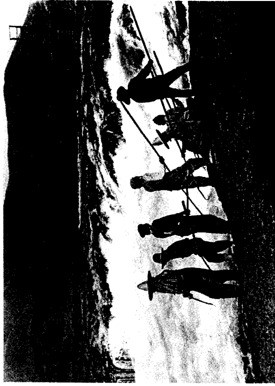
Columbia River area Native Americans fish for salmon with spears at Celilo Falls, Oregon, ca. 1910.

Then there are enormous legal issues related to management of the public lands in the West, and they are vast. Just focus on national forests. The concern has been that by cutting down trees in the forest, particularly near rivers and streams, we have taken away some of the shade that protects the spawning areas for salmon. If you cut them down, two things happen. First, you change the temperature of the water so it is less attractive for the salmon to come, and they are less likely to have successful procreation and reproduction. Second, because a lot of silt and other runoff runs into the water, you're changing the environmental conditions in the water. So