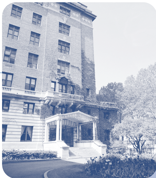
At The Rockefeller University Hospital, the outpatient clinic, inpatient unit, and research laboratories are undergoing major renovations.

Founded in 1993, DirectEffect is a volunteer group dedicated exclusively to raising funds for HIV and AIDS research at The Rockefeller University in New York City. Unlike other programs of its kind, DirectEffect contributes every dollar it raises to basic and clinical research. To date, the program has attracted more than 1300 contributors and raised more than $7 million for AIDS research at the University.